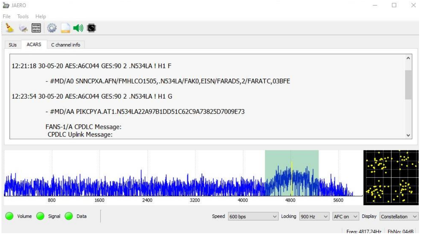
Picture: SatCom ACARS decoding with JAERO